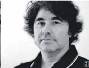
Domingos Ferreira for Two.Six

product Window standout Hand-knotted Chinese silk accents provide a surprising depth of field against Tibetan wool in breezy combinations of lustrous hues or custom colors. 212-842-1705; judyrosstextiles.com . circle 566