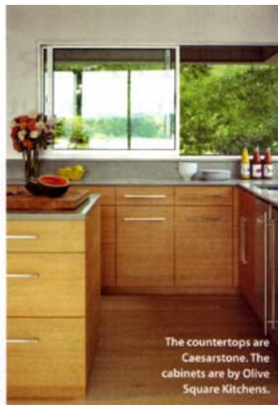
The countertops are Caesarstone. The cabinets are by Olive Square Kitchens.