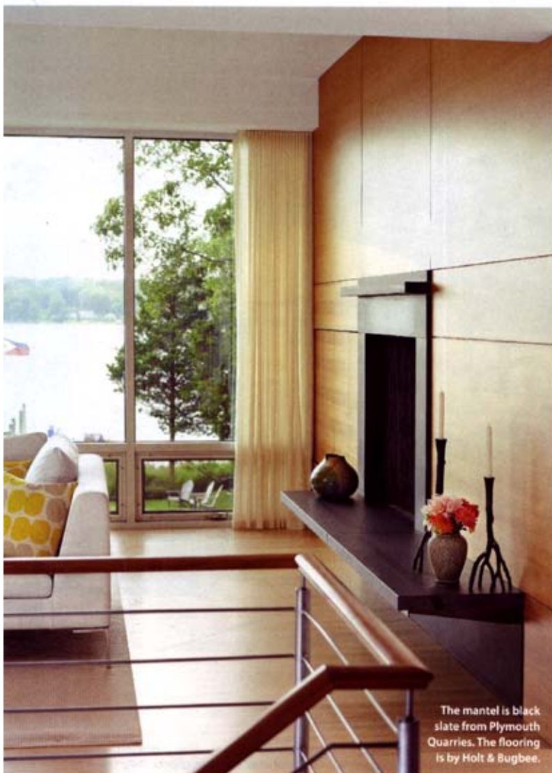
The mantel is black slate from Plymouth Quarries. The flooring is by Holt & Bugbee.

4 Repeat your favorite materials. The kitchen cabinets were fabricated from the same bleached walnut used on the fireplace surround, which was important for creating a cohesive look in the open living plan. “I cook a lot, and I really enjoy being in this kitchen,” Guidelli says. “I can socialize with guests and look out at the water at the same time.”